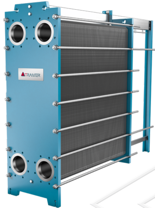
PLATE AND FRAME FOR MAXIMUM EFFICIENCY

OPTIMUM PERFORMANCE IS A PROMISE TRANTER, HAS BEEN FULFILLING FOR MANY DECADES WITH SUPERCHANGER PLATE AND FRAME HEAT EXCHANGERS. TRANTER SPECIALIZES IN PROVIDING HEAT TRANSFER SOLUTIONS IN ALL INDUSTRIES. OUR COMPLETE ENGINEERING AND MANUFACTURING EXPERTISE BRINGS YOU EQUIPMENT THAT MEETS THE HIGHEST STANDARDS OF DESIGN EXCELLENCE AND QUALITY WORKMANSHIP.